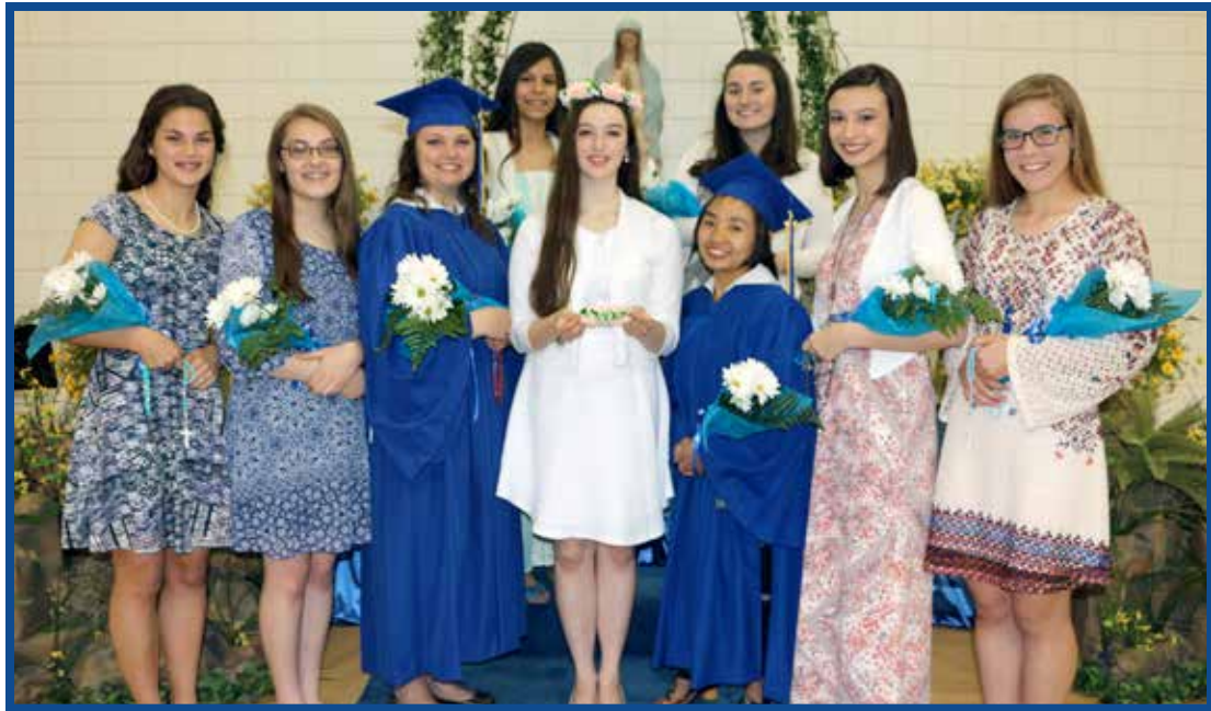
May Crowning 2016