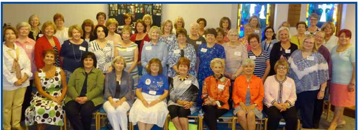
Class of 1966 Inducted into the Golden Guild