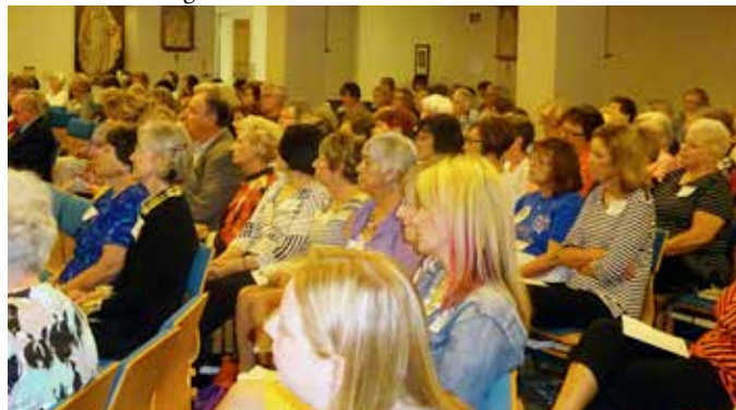
The All-School Reunion began with Mass in the chapel.